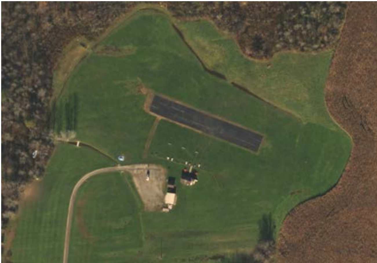
The latest satellite photo with the new runway! Just need the control line circle improvements. Thanks Gary Natali

This site has articles pertaining to both full scale and model aircraft. Check it out.